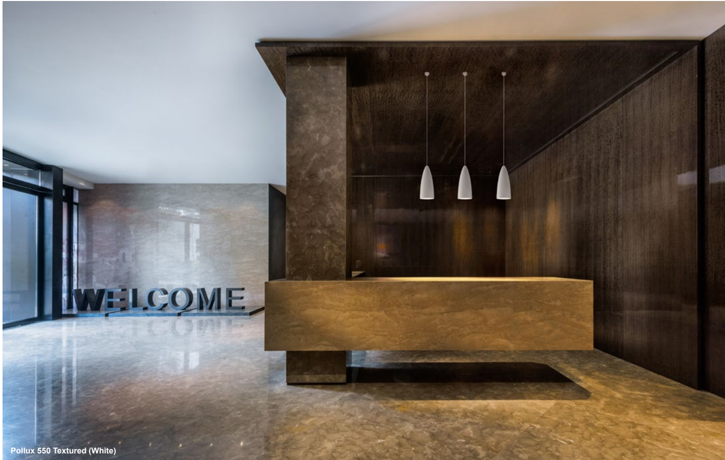
Pollux 550 Textured (White)