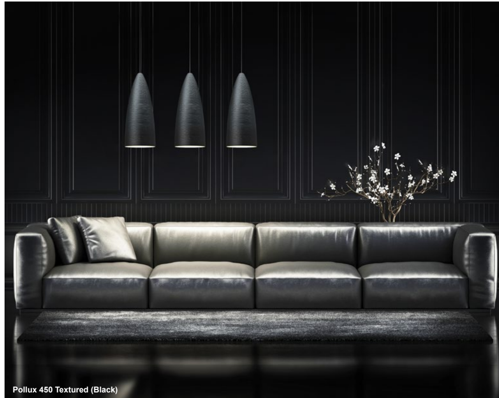
Pollux 450 Textured (Black)